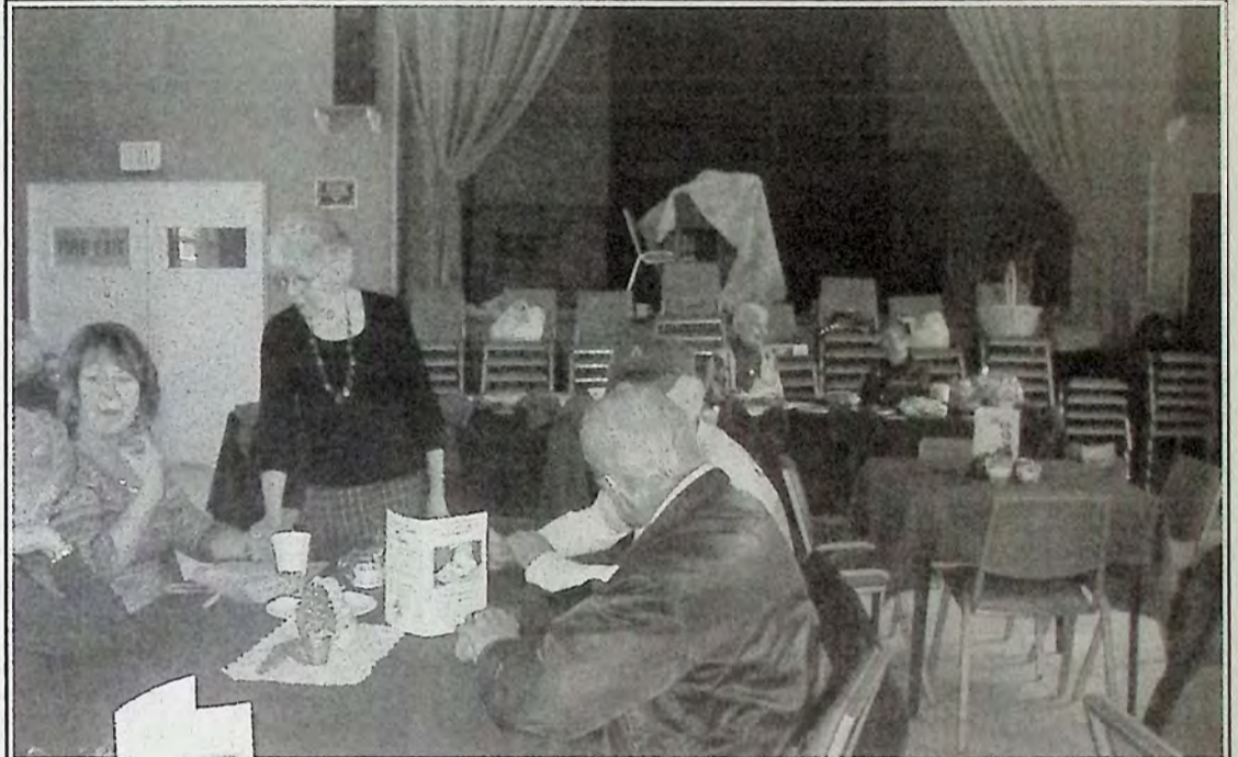
A choice of soups, a bun with cheese, and a choice of delectable desserts was the lunch served by the women of the United Church at their annual Christmas bake sale and tea on December 5. There were a lot of baked goods for sale, and most who went for lunch picked up some goodies.

I'm also not going to whine about the long distance detour because, at least there is an option and we aren't completely cut off from the rest of the interior. I will suggest that our new Town Council take a hard look at the situation and start making some noise about warnings at Kaleden and factor in Highway 3 rockslides as part of the Princeton Disaster Plan if it isn't already in there.