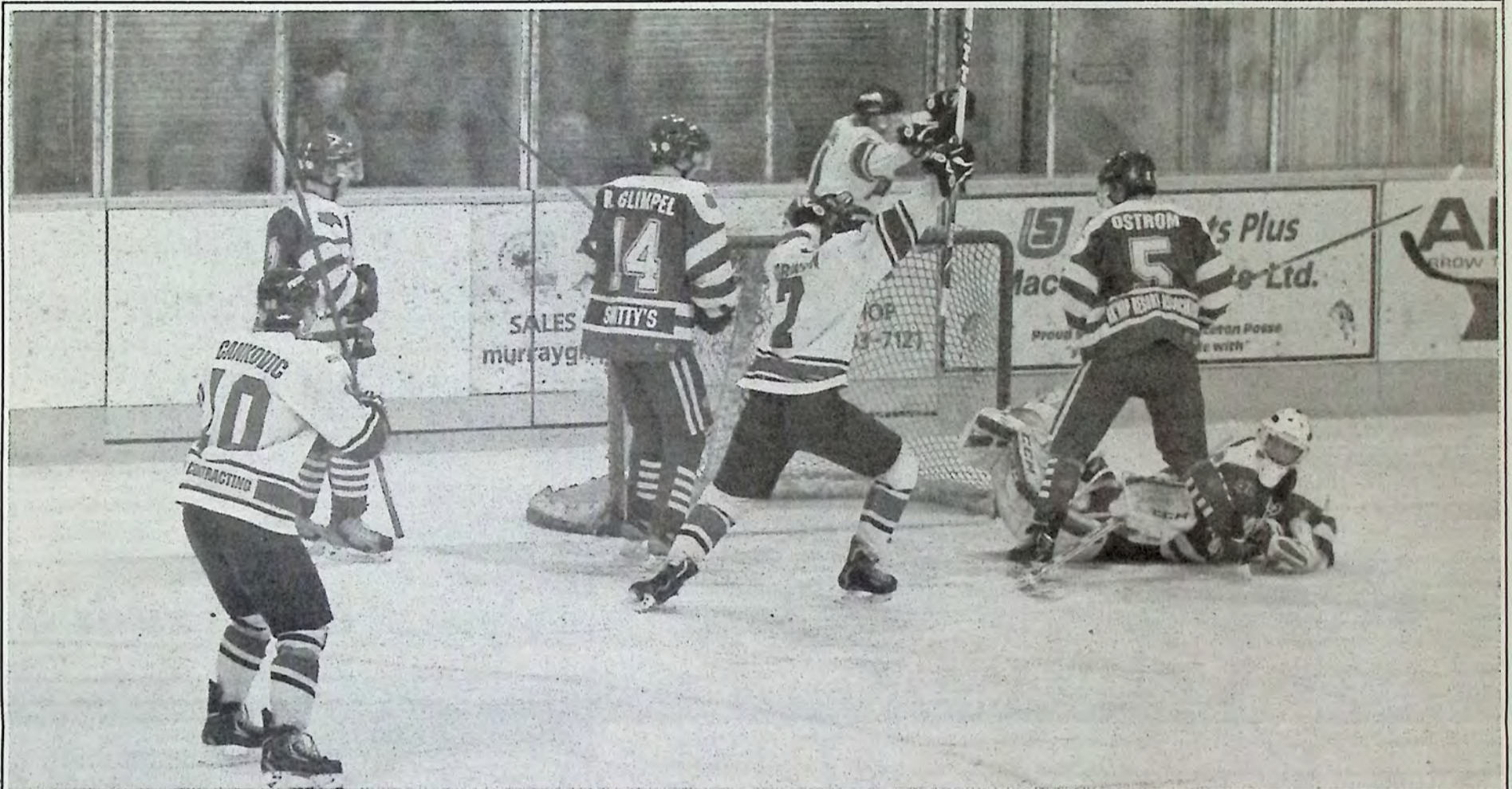
Hockey action between Princeton Posse and Osoyoos Coyotes in a recent game.

Similkameen News Leader TV Guide Listings - December 16 - 22, 2014