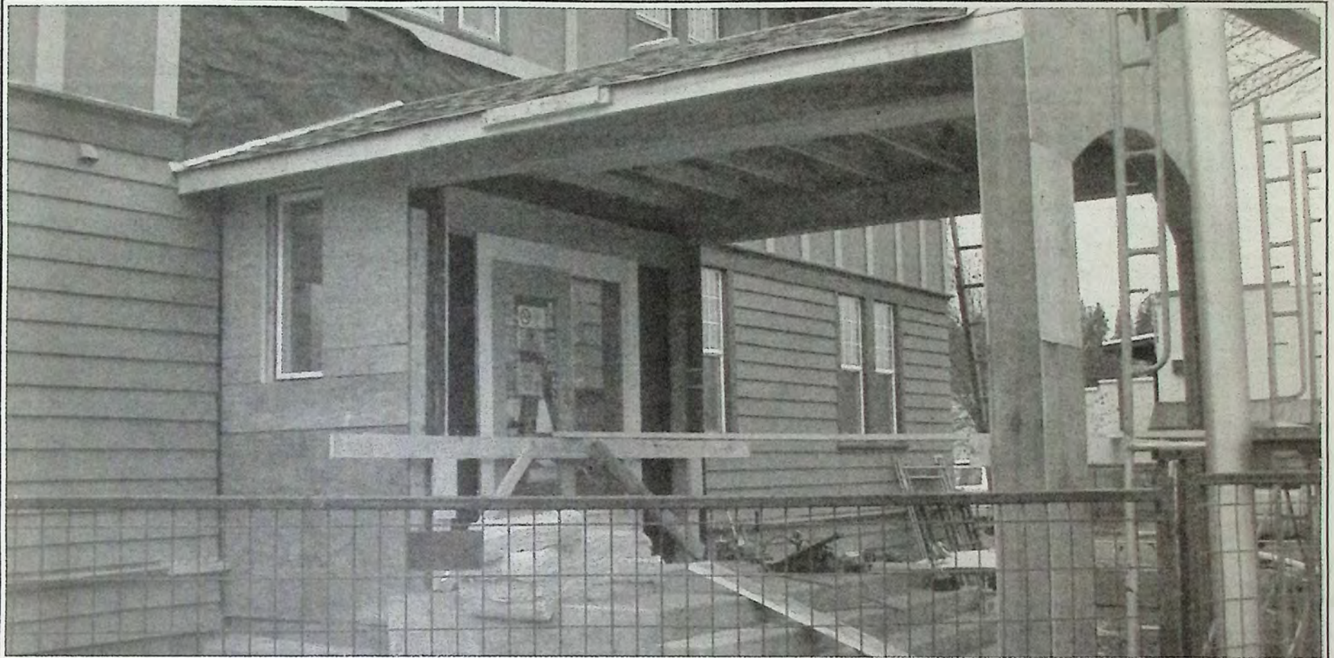
The former courthouse building being converted into a new town hall was a huge step into the future in supporting the downtown core engineered by the Town of Princeton. *