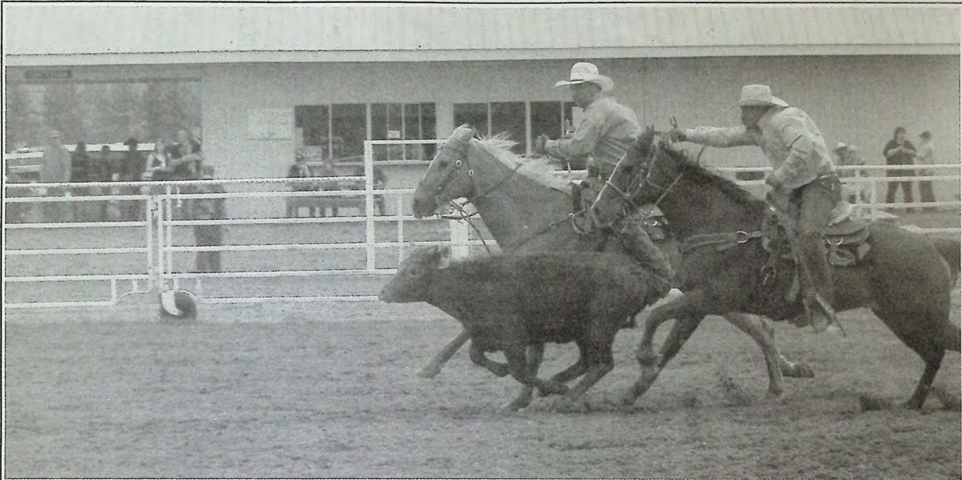
Instead of happening before Tonasket's rodeo, Princeton Rodeo Club has moved their event to take place after their Sister City rodeo. *