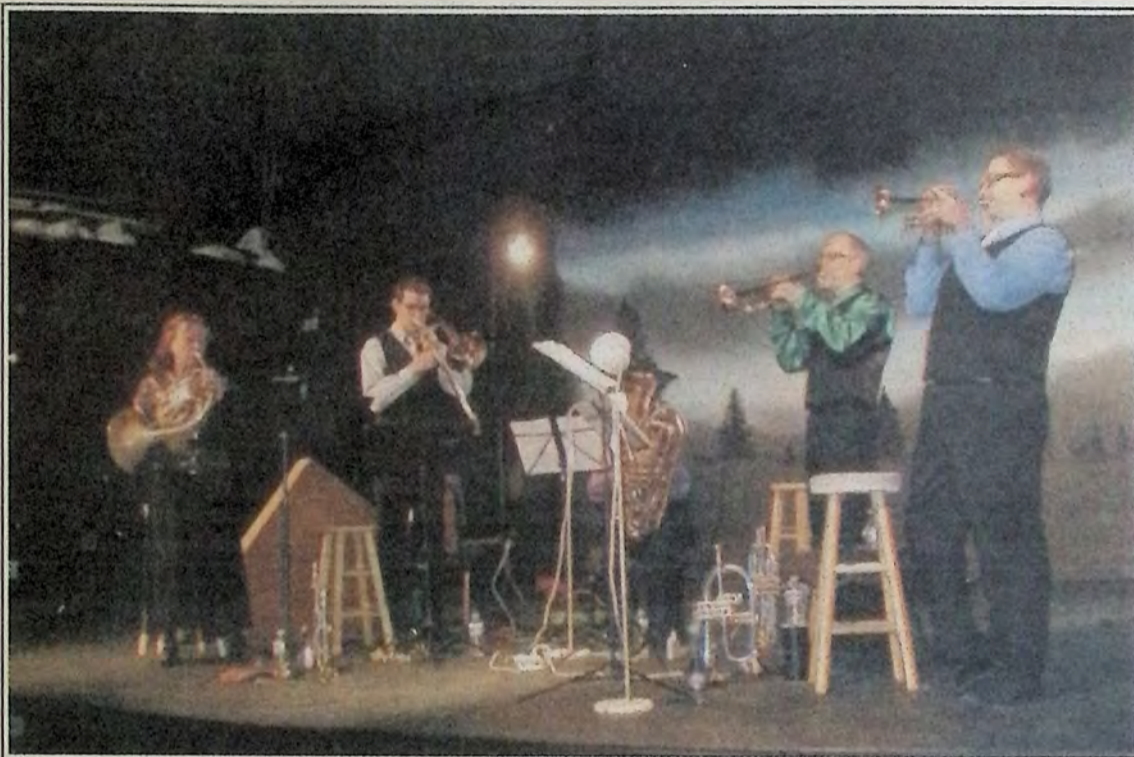
Princeton Arts Council presented Foothills Brass December 6th.

FOLLOW DENNIS WALKER ONLINE - NEWS, WEATHER, MUSIC, INTERVIEWS - www.socountry.ca