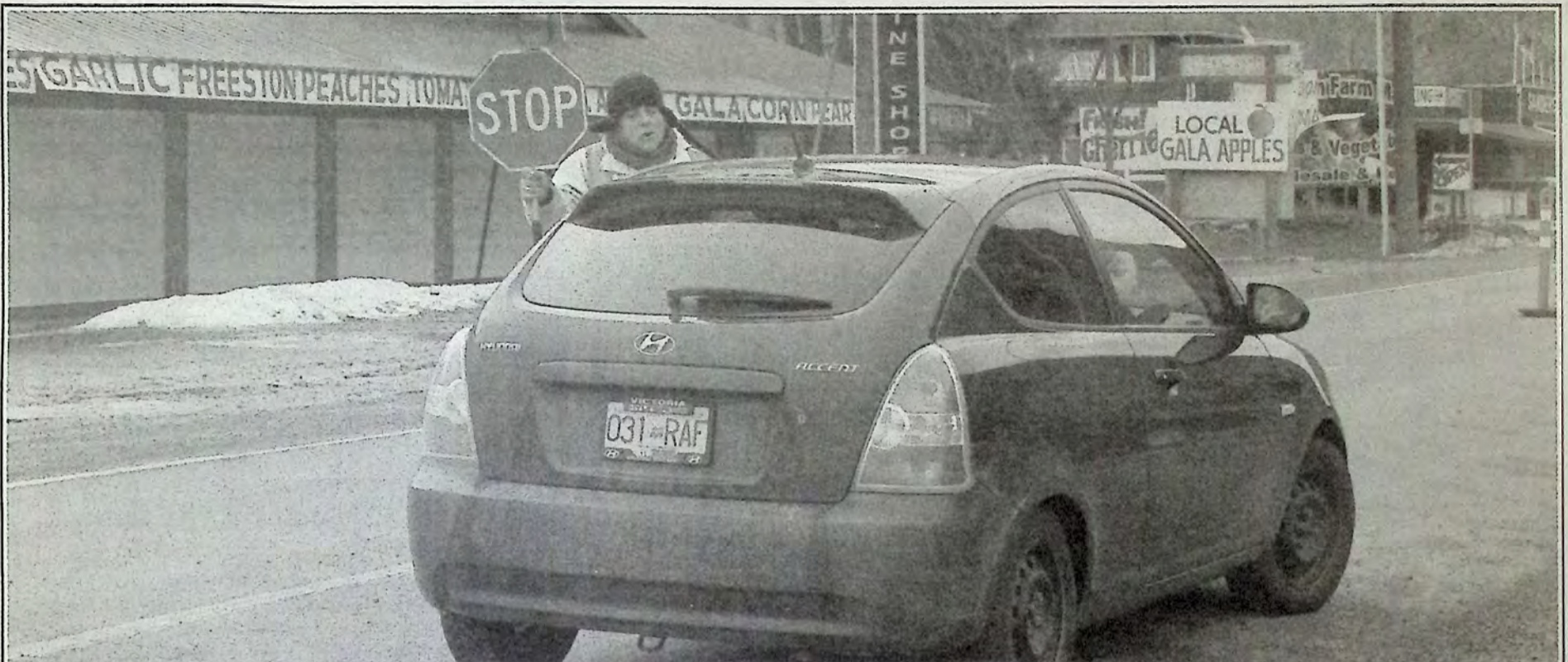
Westbound travellers out of Keremeos were inconvenienced between the afternoon of December 9th and 10th due to another rock slide west of Keremeos. The slide occurred at the same site where there is ongoing problems and resulted in Highway 3 being closed for approximately 24 hours. The flag person pictured here at the corner of Highway 3 and the Bypass Road had the task of telling travelers they needed to head through Penticton and over the Connector in order to proceed. By early afternoon on December 10th the debris had been cleared. The standard procedure is to watch the site of a rock slide for 24 hours after the debris is cleared. The 24-hour vigil provides an opportunity to monitor the scene in case there is more sliding rocks. Depending on the indicators, the Ministry has the option to keep the highway closed for that 24-hour vigil or to let travelers through with a warning.