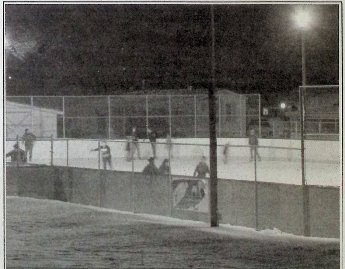
The Keremeos outdoor skating rink was getting good use December 7th. However, with recent warm winds the ice surface melted and by December 10th the Facility Manager Karl Donoghue closed the rink until colder temperatures prevail. Depending on weather conditions, the rink is typically open for sponsored Christmas skates at 1:00 PM (December 20, 26, 27, 28 and 30), 3:00 PM (December 22 and 23) and 6:00 PM (December 21).

cial say the site will receive a lot more attention next summer due to a planned project. The work is expected to include an excavating of the slope along with the construction of a much larger catchment area. There are no details on when this project will begin.