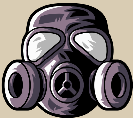
Mine Rescue Apparatus and Auxiliary Equipment