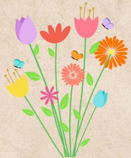
Part of the Goodfellow Collection