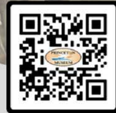
Collection Access Site

Try out our new Collection Access website: princetonbcmuseum.com