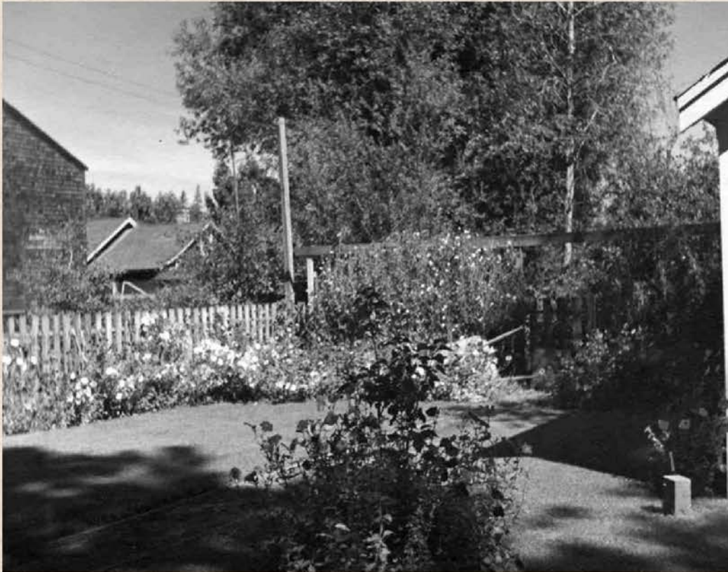
“Our 1944 Garden”

We acknowledge the Similkameen Valley on which we learn, work, and organize is the ancestral, traditional and unceded territory of the Similqmix People, and is home to the Upper Similkameen Indian Band